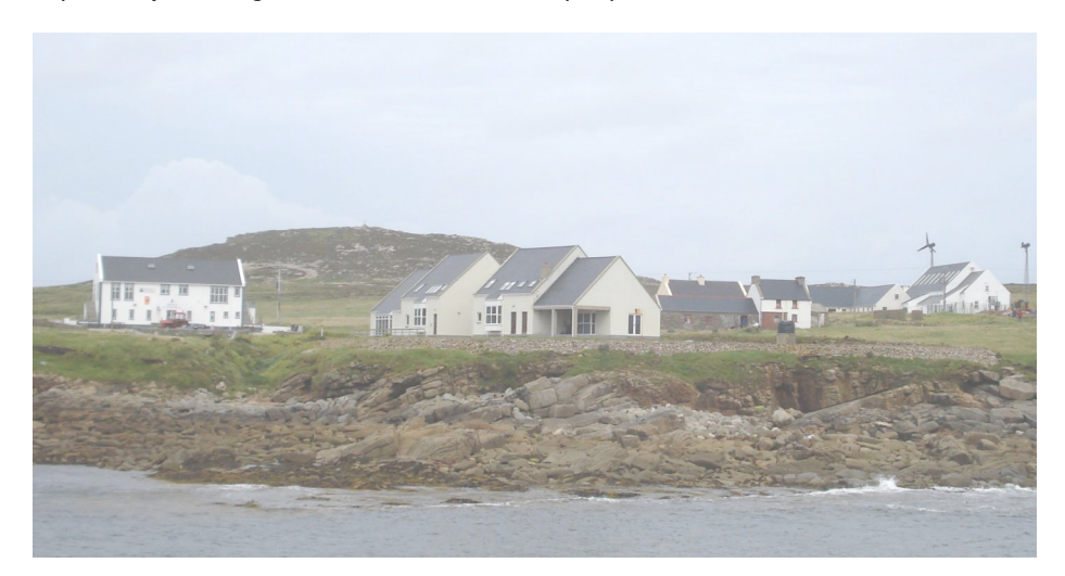
Figure 5 - New developments on Tory, County Donegal