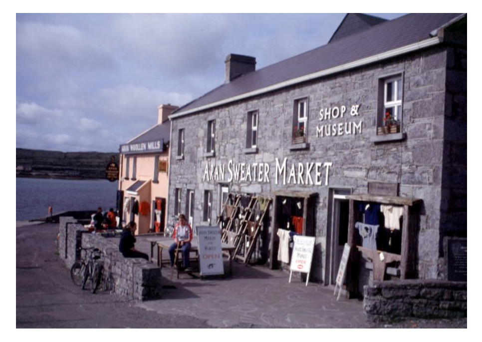
Figure 4 - Aran sweater shop, Inishmore, Co Galway

Regarding culture and heritage, the author has published a paper which discuses whether the Irish islands celebrate or exploit their heritage (Royle, 2003). One that nears the latter is Inishmore, County Galway, which might be considered as a museum of itself. The largest of the three Aran Islands, Inishmore has focused on tourism, marketing its heritage and also its landscape with characteristic tiny walled fields and ancient stone forts, especially Dún Aonghasa on its magnificent clifftop site. Tourism has helped many islanders to build modern bungalows, past that trippers pass with barely a glance en route to photograph the handful of extant traditional whitewashed thatched cottages in which few islanders now live. Tourists also have opportunities to buy Aran sweaters, a faux 'traditional' garment developed only in the early 20th Century by enterprising locals looking for a marketable product (Figure 4). Inishmore's visitors enjoy a real experience but one that is partial, focusing on the picturesque not the commonplace. The author, in interviewing people from other islands, has seen them shudder at Inishmore 'selling out', but that island now has nearly as high as level of services as mainland areas with supermarkets, banks and quards (police). Inishmore's population was at its lowest at 824 in 2006 but, as Table 2 shows, it has been fairly stable in recent years, supported by this new economy.