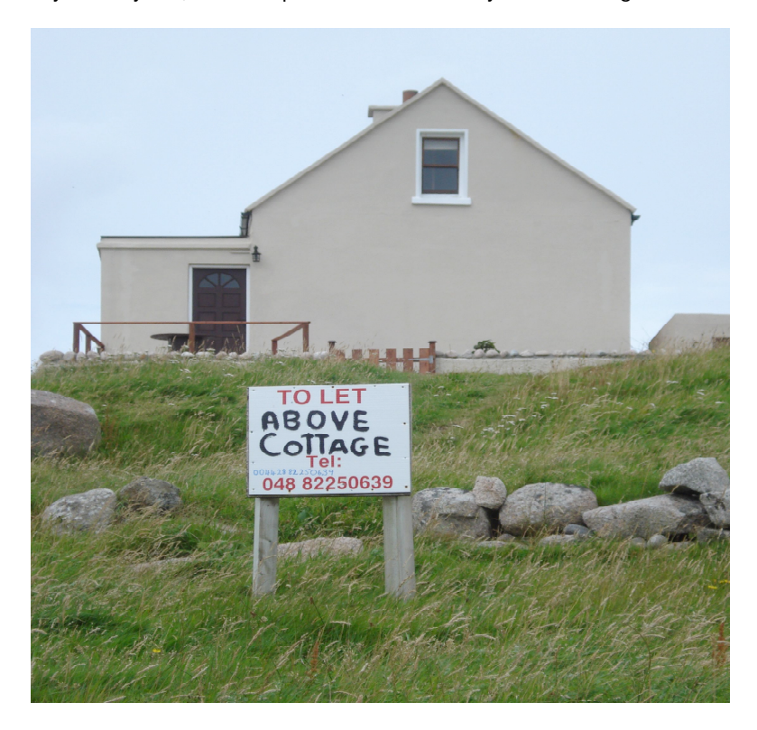
Figure 3 – Holiday cottage to let, Gola, County Donegal

of 27 at the 2006 census, having been abandoned in 1974. One must question whether such repopulations, however, represent a return of proper island communities. The author recently carried out fieldwork on Gola, County Donegal. This island, the location of Aalen and Brody's classic 1960s study of depopulation, regained a presence in the census in 2002 for the first time since 1966. Observation showed a pile of building material on the quay; mains water had recently been installed and the visit was accompanied by the sound of hammering as house repairs were being carried out. However, a number of the few inhabitable houses in the ruined village had signs advertising that they were available for holiday lettings (Figure 3). This and other islands are being 'repopulated' largely or, in some cases, only by visitors and the census, in Ireland a de facto count of where people are on census night rather than a record of where they actually live, would capture those on holiday there that night.