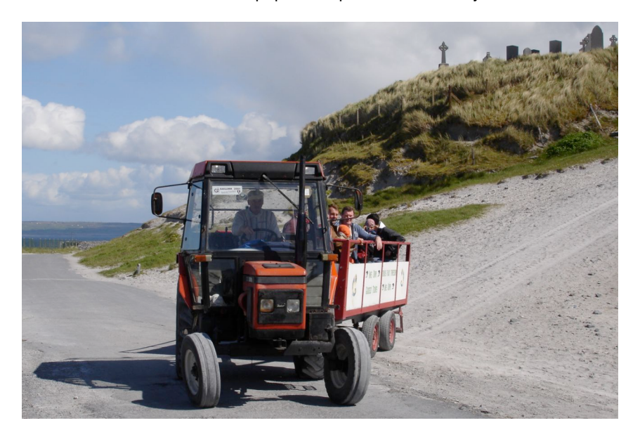
Figure 2 - Tourists take a trip around Inisheer, County Galway

the 'regard' is less straightforward as will be seen, but can have direct impacts and contribute to population growth on some of the islands after over a century of decline as both outsiders and returned migrants invest in island property and, occasionally, businesses. These trends have helped some of the Irish islands to move "from marginality to resurgence" to use the title of the conference at Macquarie University at which a PowerPoint version of this paper was presented as a keynote address<sup>2</sup>.